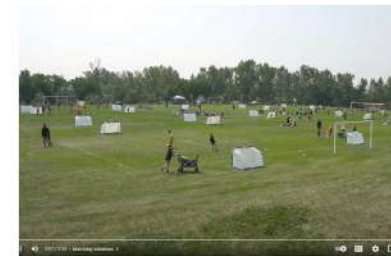
U10 - U11 Initiatives to Prevent Lopsided Matches