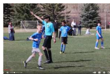
CMSA's Teal Shirt Campaign (First Year Referees)