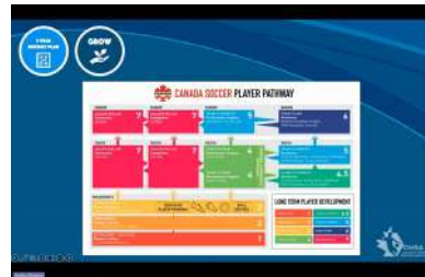
Townhall Informational Series