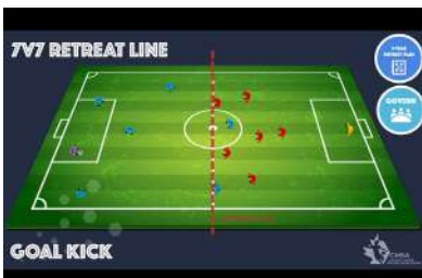
Soccer Retreat Line Explained