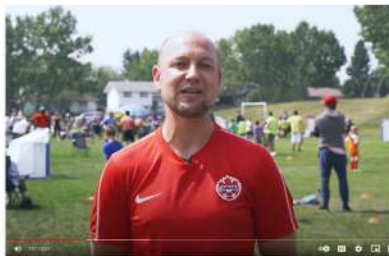
All About the CMSA Grassroots League (U7-U9)

Click on any of the videos below to watch. These videos and more can be found on CMSA's Youtube Channel.